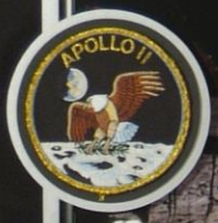
"Houston, Tranquility Base here. The Eagle has landed." - Neil A. Armstrong