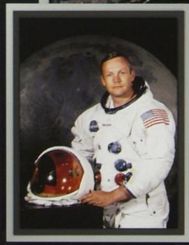
"There's one small step for a man, one giant leap for mankind." - Neil A. Armstrong