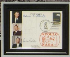
APOLLO 11 Launched: July 16, 1969 - Kennedy Space Center Lunar landing: July 20, 1969 - Sea of Tranquility First Step: July 21, 02:56 UTC