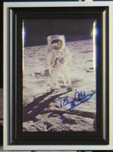
"Close your eyes, I can't be there again. Not by you, not by anyone else." - Apollo 11 crew