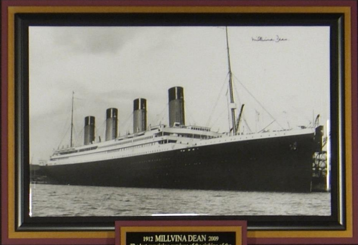
1912 MILLVINA DEAN 2009 The last remaining survivor of the sinking of the RMS Titanic, which occurred on 15 April 1912. She was also the youngest passenger aboard.