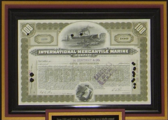
From 1901 until 1912, the White Star Line was a wholly owned subsidiary of IMC. The most famous member of the International Mercantile Marine fleet was Titanic. This "unsinkable" 45,328 ton, 852 1/2 foot ship was the largest liner the world had known. On her maiden voyage to New York April 14, 1912, she lost 14 in her cargo. Of the 4,540 crew and passenger aboard, only 705 were saved.