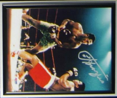
"The 11th most exciting and best-selling book in the world... 'The Fight of the Year'... Manny Pacquiao vs. Floyd Mayweather Jr.'" —Sports Illustrated