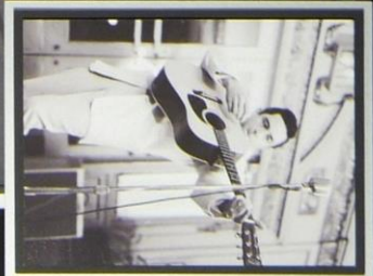
1933 JOHNNY CASH 2008 THE MAN IN BLACK "There is a burning desire and a desire to sing. My father is a wild man. I'll be a King of the..."