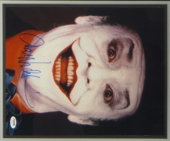
"What did they get a hold of now?" -The A-Team (Jack Nicholson)