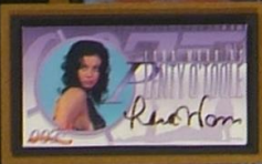
LANA WOOD "Plenty O'Toole"

Starring JILL ST. JOHN as TIFFANY CASE · CHARLES GRAY Also starring LANA WOOD as PLENTY O'TOOLE · JIMMY DEAN · BRUCE CABOT · Produced by HARRY SALTZMAN and ALBERT R. BROCCOLI · Directed by GUY HAMILTON Screenplay by RICHARD MAIBAUM and TOM MANKIEWICZ · Production Designed by KEN ADAM · Music by JOHN BARRY · PANAVISION® · TECHNICOLOR® Copyright © 1971 UNITED ARTISTS CORPORATION