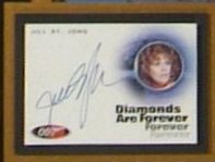
JILL ST. JOHN "Tiffany Case"