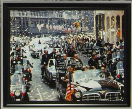
APOLLO 11 Launched: July 16, 1969 - Kennedy Space Center Lunar landing: July 20, 1969 - Sea of Tranquility Fleet Day: July 21, 02:56 UTC