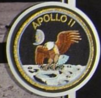
"Once you've been first, it cannot be done again. Not by you, not by anyone else." -Edwin "Buzz" Aldrin