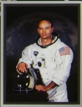
"No one should do things that have never been done before. That's what being a pilot is." -Michael Collins