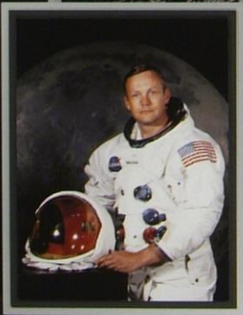
"That's one small step for a man, one giant leap for mankind." -Neil A. Armstrong