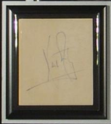
"Houston, Tranquility Base here. The Eagle has landed." -Neil A. Armstrong