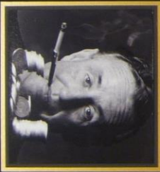
"The most iconic and best-selling agent in the world."