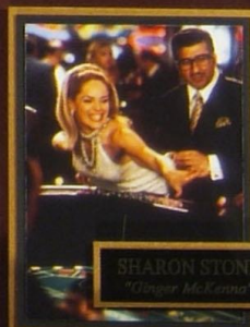
SHARON STONE "Ginger McKenna"